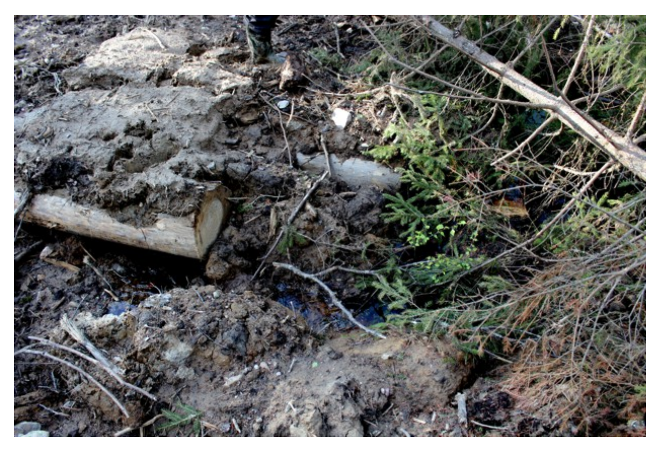
According to the Logging Regulations adopted by the order of Federal Agency of Forest management dd 1<sup>st</sup> of August 2011 N 337, article 13, it is prohibited to use rivers and streams' beds as skidding trails and forest roads.