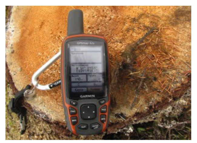
II. Podporozhskoye forest area, Tokarskoye forestry, 58, 63, 73 kvartals, planned nature protected area "Vachozero"

Several cutting sites close to lake "Vachozero" were inspected.