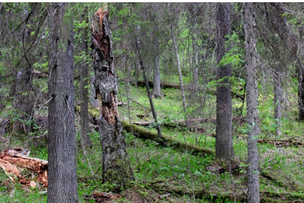
The loggings are made in the planned protected area "Vachozero" which is of high conservation value.