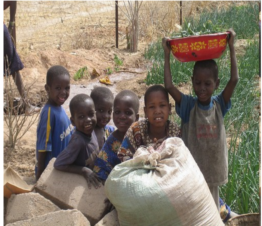
Dodo's Sinsibere project: Children in garden